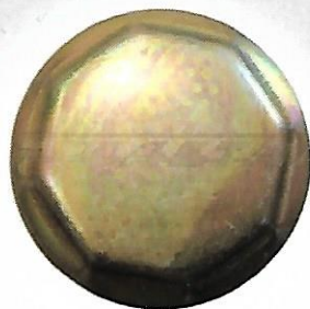
G.I CAP 1/4" to 4" Bis Pipe Fittings