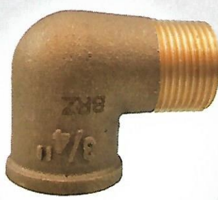
G.I, ST. Elbow 90° 1/4" to 4" Bis Pipe Fittings