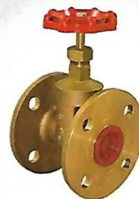
Bronze Gate Valve Undrilled F/T From 1/2" to 4"