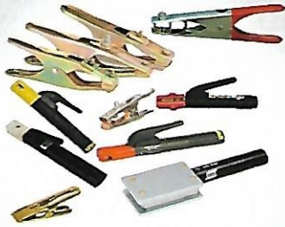
ELECTRODE HOLDER CLAMP/TIP CLEANER