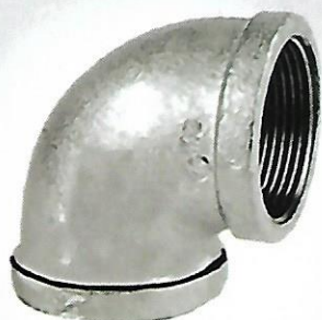
G.I Elbow 90° 1/4" to 4" Bis Pipe Fittings