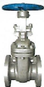
C.S Gate Valve WCB 216, CL150, CL300 F/T From 1/2" to 14"