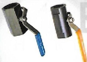
C.S Ball Valve XDS 800WOG From 1/4" to 4" NPT & BSPT