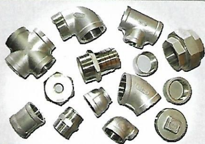
M.S Pipe Fittings L/P 1000# From 1/4" to 2" BSPT