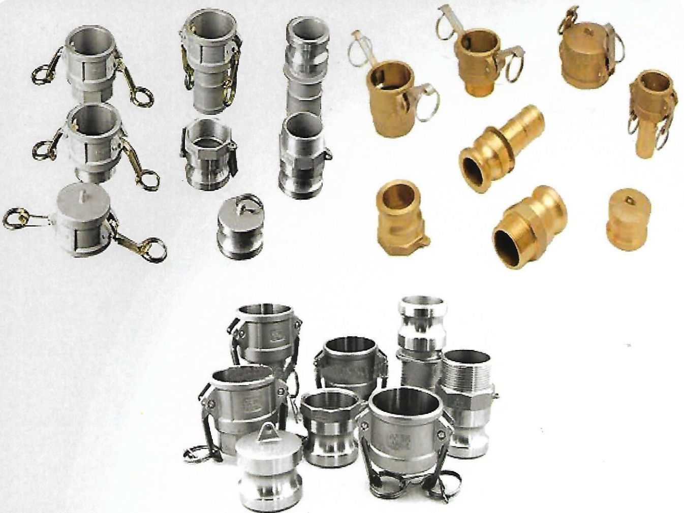
Camlock Couplings - Aluminium / Brass / Stainless Steel From 1/2" to 6" NPT & BSPT