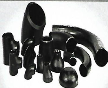
M.S B/W Pipe Fittings SMLS WBP 234 SCH 40, SCH80, SCH160 Tubing From 1/4" to 24"