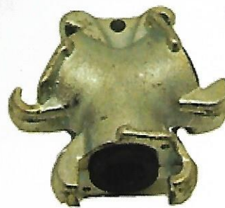
G.I Chicago 3 Way