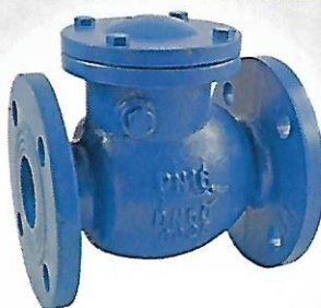
C.I Swing Check Valve PN16 F/T From 1" to 12"