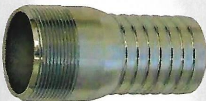
G.I King Nipple From 1/2" to 12" NPT & BSP T