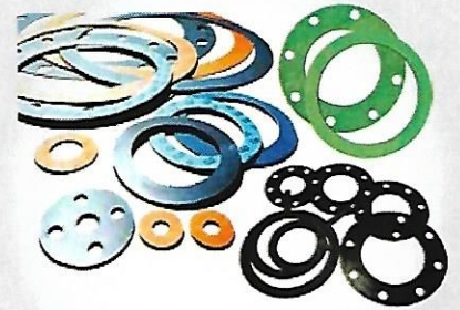
CAF, CNAF, Rubber Gas ket Rings Type & Full Face 1.5mm, 3mm, CL150, CL 300, CL 600, PN 16, PN 20, PN 25, PN 40 From 1/2" to Any Size