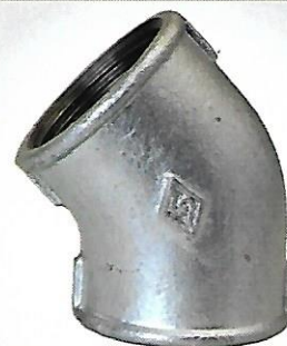
G.I Elbow 45° 1/4" to 4" Bis Pipe Fittings