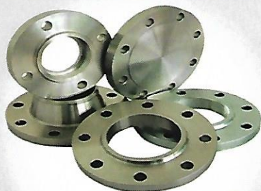
S.S Flanges A182/316L SSOR FSWR/WNRF/Blind Screwed: PN16, CL150, CL300, CL600, 5K, 10K, 16K SCH10, SCH 40, SCH 80 From 1/2" to 24"