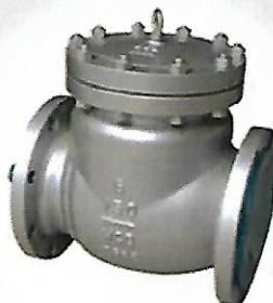
C.S. Check Valve WCB 216, CL150, CL300 F/T From 1/2" to 12"