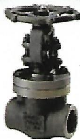
M.S. Forged Steel Gate Valve 800# From 1/2" to 2" SW & NPT