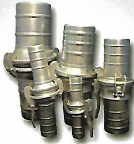
Bouwer Couplings From 2" to 8"