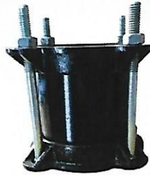
VJ Pipe Joining Coupling Size: From 2" to 24"