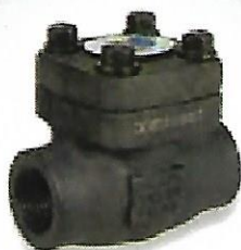
M.S. Forged Steel Check Valve 800# From 1/2" to 2" NPT & SW