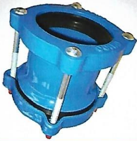
Universal Pipe Joining Coupling Size: From 2" to 24"