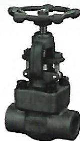
S.S. Forged Steel Gate Valve From 1/2" to 2" SW & NPT