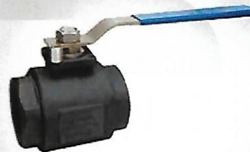
C.S Ball Valve 2PC 3000WOG From 1/2" to 2" NPT