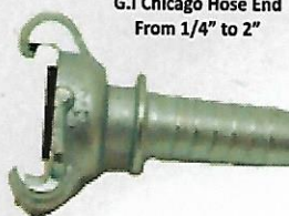
G.I Chicago Hose End From 1/4" to 2"