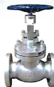
C.S Globe Valve WCB 216, CL150, CL300 F/T From 1/2" to 12"