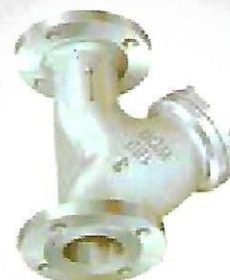
C.S Y Strainer WCB 216, CL 150 F/T From 1.1/2" to 8"