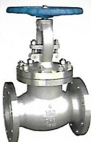
S.S. Globe Valve CL150 CF8 F/T From 1/2" to 6"