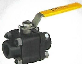
C.S Ball Valve 3PC Design 3000# From 1/4" to 2" NPT