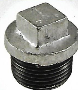
G.I Plug 1/4" to 4" Bis Pipe Fittings