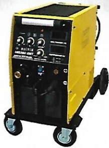
WELDING MACHINE VICTOR