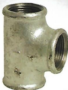
G.I TEE 1/4" to 4" Bis Pipe Fittings