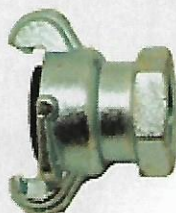
Chicago Female End From 1/4" to 2"