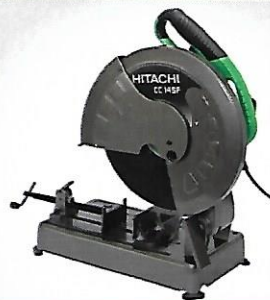
CUT OFF MACHINES