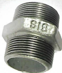
G.I HEY Nipple 1/4" to 4" Bis Pipe Fittings