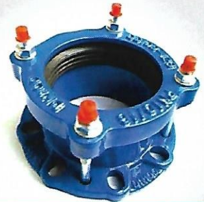
Universal Flange Adapters PN 16 Size: From 2" to 24"