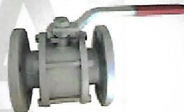
C.S Ball Valve WCB 216, 3PC Body Design CL150 F/T From 1/2" to 6"