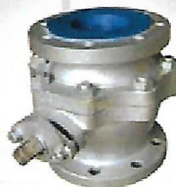
C.S Ball Valve WCB 216, 2PC Body Design CL150 F/T From 1/2" to 12"