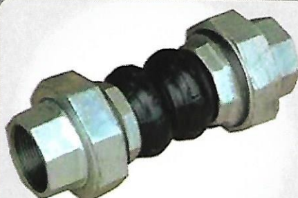
G.I Flexible Union Connector From 1/2" to 3"