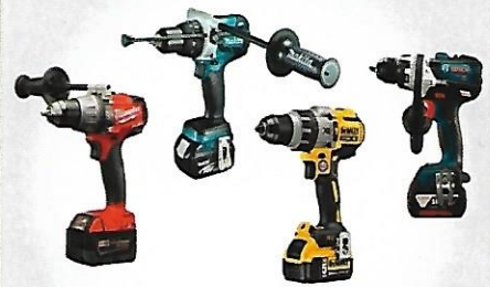
CORDLESS DRILL IMPACT WRENCH