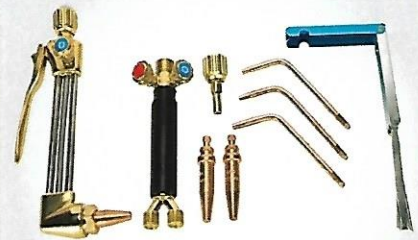
CUTTING TIPS/NOZZLE/ CUTTING TORCH/LIGHTERS