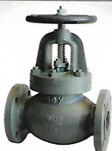
C.I Globe Valve CL150 F/T From 1/2" to 12"