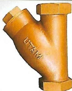
Bronze Y Strainer From 1/2" to 2" NPT