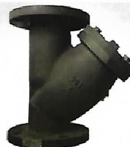
C.I Y Strainer CL150 F/T From 1.1/2" to 8"