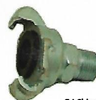
G.I Chicago Male End From 1/4" to 1"