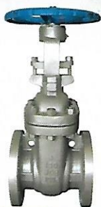
Stainless Steel Gate Valve F/T CL150 From 1/2" to 10"