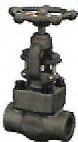
M.S Forged Steel 800# Globe Valve From 1/2" to 2" SW & NPT