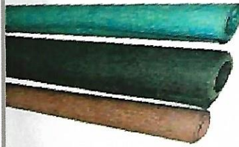
CAF, CNAF, Metallic & Non Metallic Gas ket Sheets 1.5Mtr. x 1.5Mtr, 1mm To 6mm