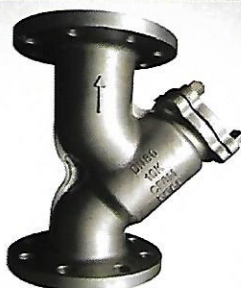
C.I Y Strainer PN16 F/T From 1.1/2" to 12"