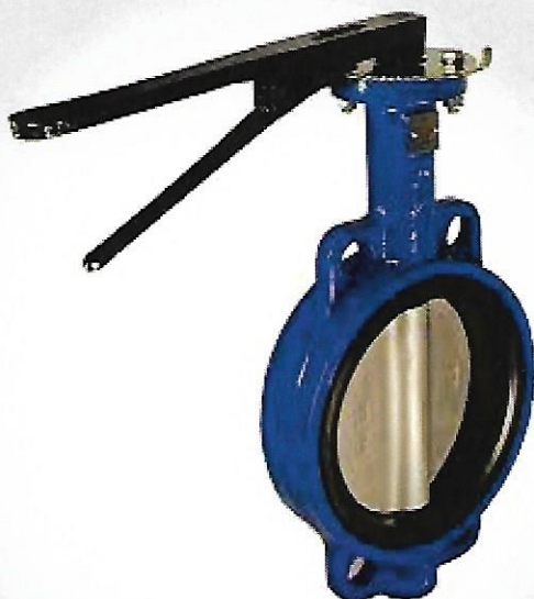
C.I Butterfly Valve C.I Body Ductile Iron Disc Lock & Lever Type From 1.1/2" to 12"