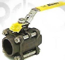
C.S F.S Ball Valve 3PC 1000 # From 1/2" to 4" NPT & BSPT