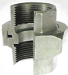
G.I Union 1/4" to 4" Bis Pipe Fittings