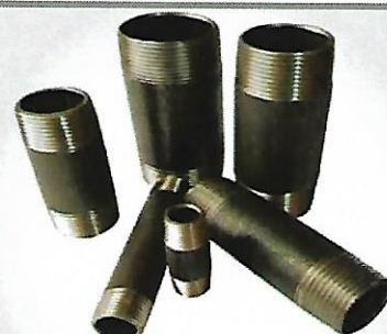
M.S Long Nipples & Close Nipples A105 SMLS, ERW SCH40, SCH80, SCH160 Size: 1/4" to 6" X 8" NPT & BSPT