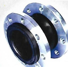
G.I Flexible Flange Connector Single Below CL150 & PN16 From 1" to 24"