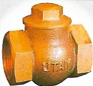
Bronze Check Valve Lift Type From 1/2" to 2" NPT