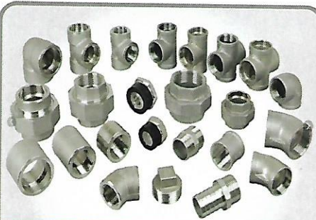
M.S Forged Pipe Fittings A105 2000#, 3000#, 6000# From 1/8" to 4" NPT & SW