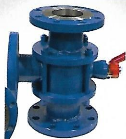
C.I Ball Valve PN16 2PC Design F/T From 1/2" to 8"