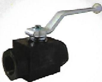
C.S Ball Valve Hydraulic 6000# From 1/4" to 2" NPT