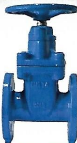
C.I Gate Valve Resilient Sealing PN16 F/T From 1" to 24"