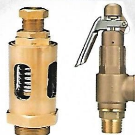
Bronze Safety Valves with & without Lever 20 Bar From 1/2" to 2" NPT