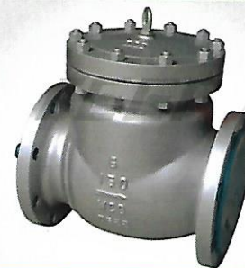
S.S. Swing Check Valve CL150 F/T From 1/2" to 10"