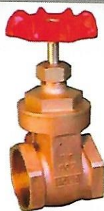
Bronze Gate Valve From 1/4" to 4" NPT & BSP T