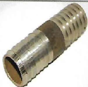
G.I Hose End or From 1/2" to 8"