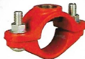
Grooved Mechanical Tee