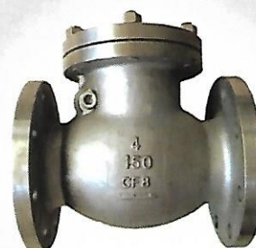
C.I Swing Check Valve CL150 F/T From 1.1/2" to 12"